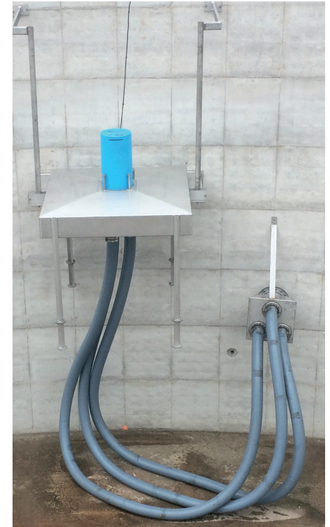
AQUADECANT® 2017 BOORTMALT